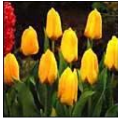
Figure 4. Candela