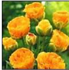
Figure 2. Beauty of Apeldoorn