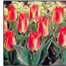
Figure 5. Plaisir

Order your bulbs early enough that they can spend anywhere from 8 to 10 weeks basking in the chill of your frig. Store them in a mesh bag so that they get good air circulation. If you are a fruit lover you may want to strongly consider getting a spare refrigerator – one of the minis so readily available. Fruit gives off ethylene gas – and ethylene gas will kill the flower inside your bulbs.