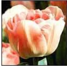
Figure 1. Angelique

Tulips are classified with perennials but often need to be treated as annuals. Dig up your tulip bulbs once the foliage has died & store them in a cool dry area for replanting in the fall. There are a wide variety of tulips, some are shown in the following figures.