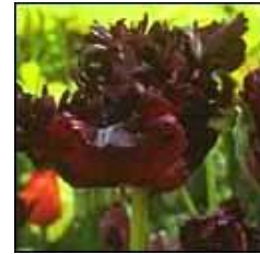
Figure 3. Black Parrot